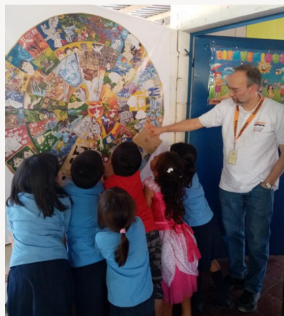
Board game "Journey to discover the other"