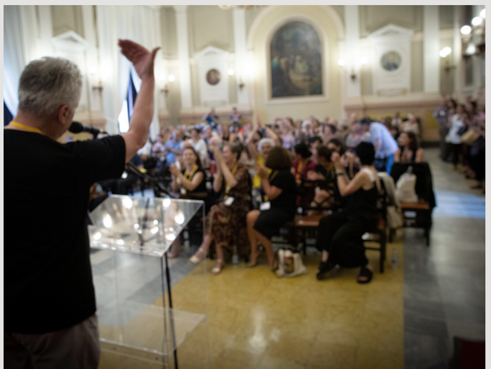
Annual General Meeting in Sassari on 22 June 2023